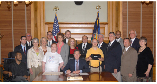
DRC staff, disability advocates, and legislators at a bill signing with Governor Brownback.

DRC obtains justice for people with disabilities. We are interested in the broad spectrum of disability rights issues including – abuse & neglect, public accommodations, employment, Medicaid, Home and Community Based Waiver services, and Vocational Rehabilitation. DRC fights for justice through negotiation, client advocacy, administrative hearings, court action, self-advocacy support and technical information assistance and referral. DRC's public policy advocacy efforts educate legislators, states government policymakers, the press and the public to promote disability rights in Kansas. Finally, DRC promotes outreach activities and training in order to educate people with disabilities about their rights.