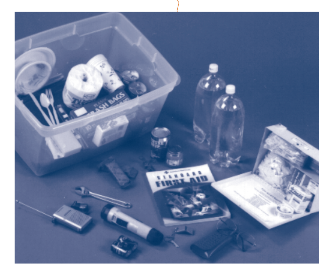
Gather your basic disaster supplies and store them somewhere that is easy for you to get to.

budget, try to include a few items for your kit. See the Disaster Supplies Calendar, Appendix B, page 41 for a suggested weekly shopping list. Talk with your personal physician about how you can collect and store a seven-day supply of necessary prescription medications.