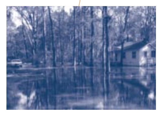
In a disaster, roads and sidewalks may be covered by mud, water, or debris. You may not be able to tell where roads and sidewalks begin or end.

or debris, so you may not be able to tell where they begin and end. Mud, sand, and other materials may be left behind for long periods. In floods, the water may be moving very rapidly. This can keep you from leaving an area.