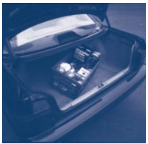
Store basic disaster supplies and other emergency items in your car.

pet. Identification tags should list both your home telephone number and that of your primary out-oftown contact person.