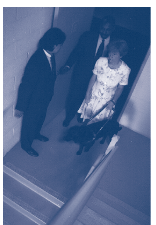
Your network should know your capabilities and needs and offer help within minutes.

Explain to your network any assistance for personal care that you may need. Give them written instructions on how best to assist you and your animals.