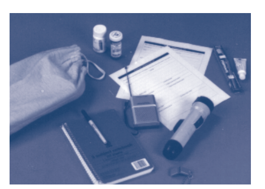
Keep your portable disaster supplies kit within easy reach at all times.

Disability-related supplies can be part of both your basic and your