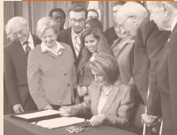
Speaker of the House Nancy Pelosi signs this year's health care legislation.