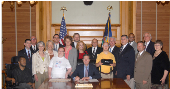
DRC staff, disability advocates, and legislators at a bill signing with Governor Brownback.

DRC obtains justice for people with disabilities. We are interested in the broad spectrum of disability rights issues including – abuse & neglect, public accommodations, employment, Medicaid, Home and Community Based Waiver services, and Vocational Rehabilitation. DRC fights for justice through negotiation, client advocacy, administrative hearings, court action, self-advocacy support and technical information assistance and referral. DRC's public policy advocacy efforts educate legislators, states government policymakers, the press and the public to promote disability rights in Kansas. Finally, DRC promotes outreach activities and training in order to educate people with disabilities about their rights.